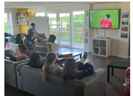
Year 13 leaving day: