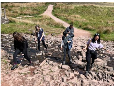
Parc House day out at Heatherton adventure park: