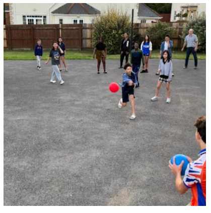
Success (Y11) coaching Junior Girls Football: