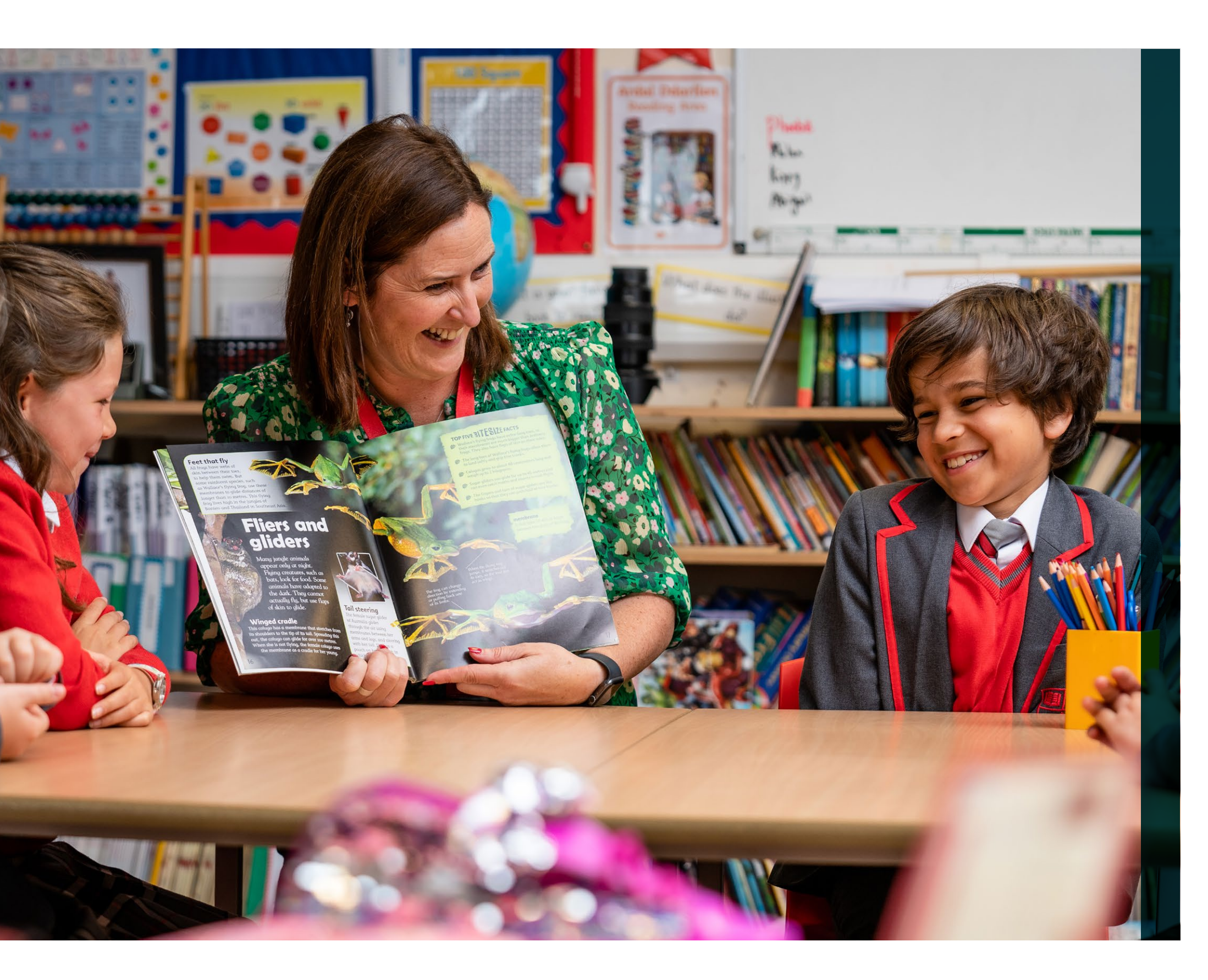
Disce ut Vivas